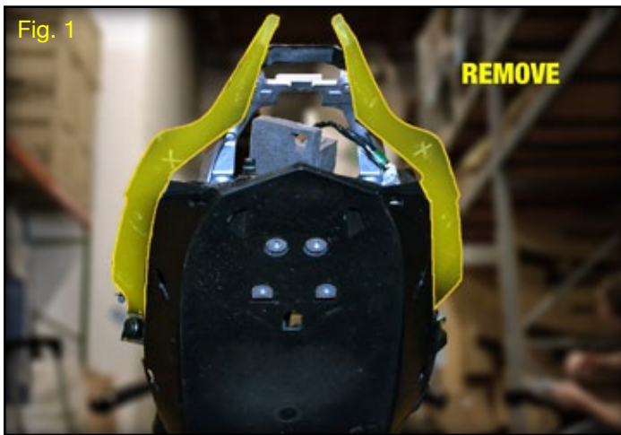
2) Cut and remove the stock plastic in the areas highlighted in Fig. 1

1) Carefully remove the stock tail section body work from the bike. Disconnect the brake light wires, license plate and turn signals, then remove the stock mud flap.