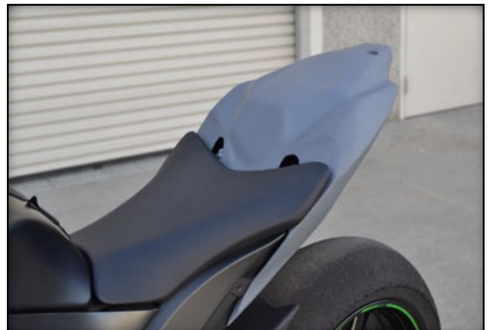
5) Final finished install after fastening the top of the tail section and the riders seat.

READ CAREFULLY BEFORE INSTALLATION! This item has been designed for off road racing use only, and has not been presented for D.O.T. certification Hotbodies Racing Inc., our distributors, and our dealers will NOT be responsible for the use or misuse of this product. Always check with your local Department of Motor Vehicles before modifying any aspect of your motorcycle.