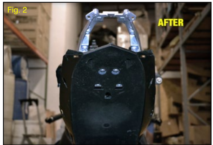
3) After plastic has been removed pictured in Fig. 2