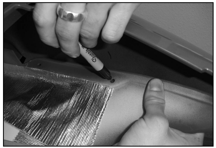
2) When tail section body work is removed, line up the undertail with tail section carefully marking holes from bottom to top, respectively on each side. Make sure tail is correctly lined up with tail section.

1) Carefully remove the tail section body work from the bike. Disconnect the brake light wires, license plate and turn signals, then remove the stock mud flap. The stock aluminum heat shield under the tail section also needs to be removed, to remove stock heat shielding loosen or remove exhaust m mounting brackets and slide the heat shield out of place. Save all bolts, washers and plastic rivets for re-installation of tail.