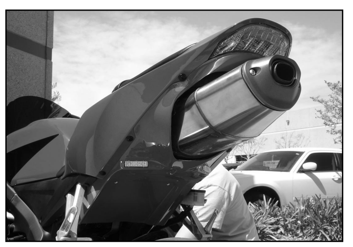
5) Make sure your exhaust is fully tightened and re-install all tail section plastics and connect the LED turn signals to the undertail. Use the plastic screw rivets to connect the undertail to the tail section.

WIRING INSTRUCTIONS: Connect the right (blue wire) and left signal (orange wire) wires on the bike, to the respective right/left <u>orange</u> wires on the undertail. The license plate light wire is black w/ brown tracer, connect to the red wire of the plate light. Connect the ground wires (green) to the <u>black</u> wires on the undertail.