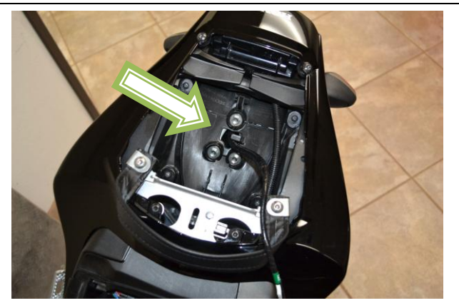
3) Using a 10mm socket and ratchet, remove the 3 bolts located directly below the passenger seat holding the mud flap on and carefully remove it.