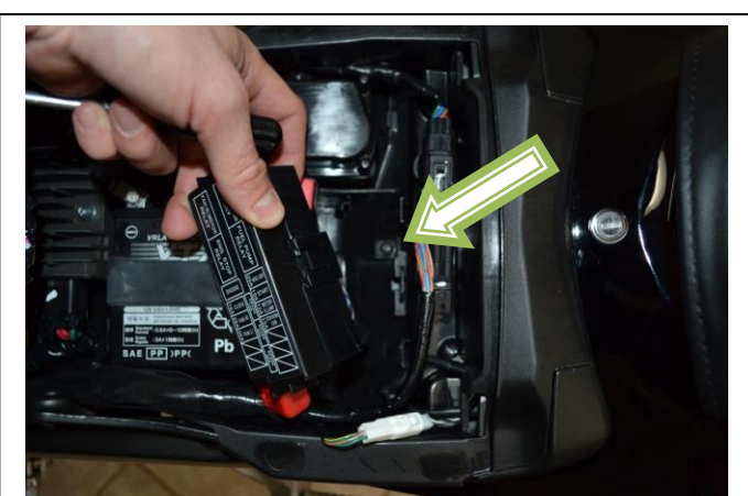
7) Re-lease the latch on the fuse box then lift up and move to the side. Remove the small phillips head bolt located behind the box.