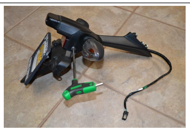
4) Remove the two 5mm hex head bolts on the sides of the mudflap.