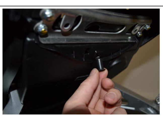
10) Insert rubber well nut from bottom up through the battery box, so the fat part is underneath the tail.