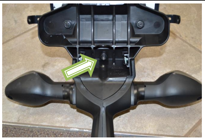
5) Also remove the 8mm nut behind the reflector and remove the cover hiding the turn signal wires within the mudflap.