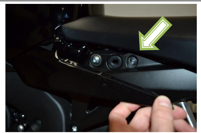
1) Remove side covers to access phillips bolts behind them to take off the rider seat. Also remove the passenger seat.