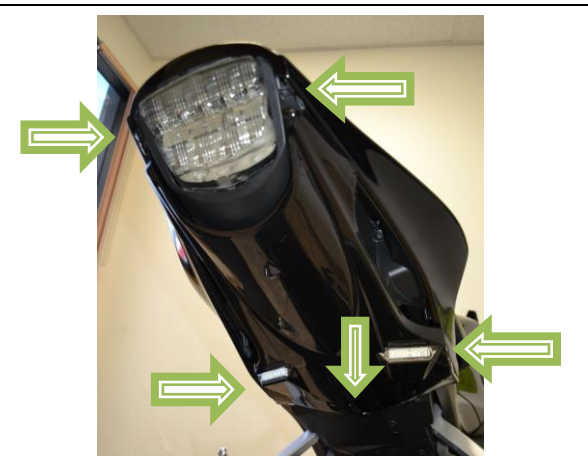
12-B) Pictures shows undertail in position for final installation, arrows mark mounting tabs and fastener.

READ CAREFULLY BEFORE INSTALLATION! This undertail like all undertails has been designed for off road racing use only, and has not been presented for D.O.T. certification! Hotbodies Racing Inc., our distributors, and our dealers will NOT be responsible for the use or misuse of this product. Always check with your local Department of Motor Vehicles before modifying any aspect of your motorcycle.