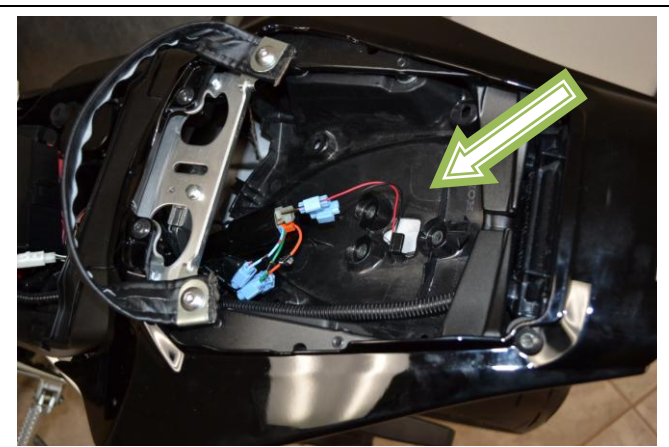
12-A) Picture shows license plate wires feeding through the hole in middle of glove box.

Re-install your fuse box, rider and passenger seats, and those side covers, you're done! Now don't crash your pretty bike! (12-B)