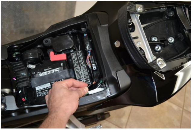
2) Follow the wires from the mudflap back towards the battery box and disconnect the plug from the harness.

READ CAREFULLY BEFORE INSTALLATION! This undertail like all undertails has been designed for off road racing use only, and has not been presented for D.O.T. certification! Hotbodies Racing Inc., our distributors, and our dealers will NOT be responsible for the use or misuse of this product. Always check with your local Department of Motor Vehicles before modifying any aspect of your motorcycle.