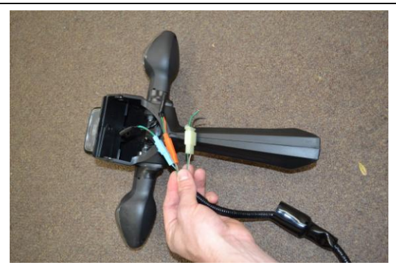
6) Cut the wires closest to the signal lights and remove wiring harness from mudflap. This will allow you to re-use your stock plugs when you hooking it up to the new undertail.