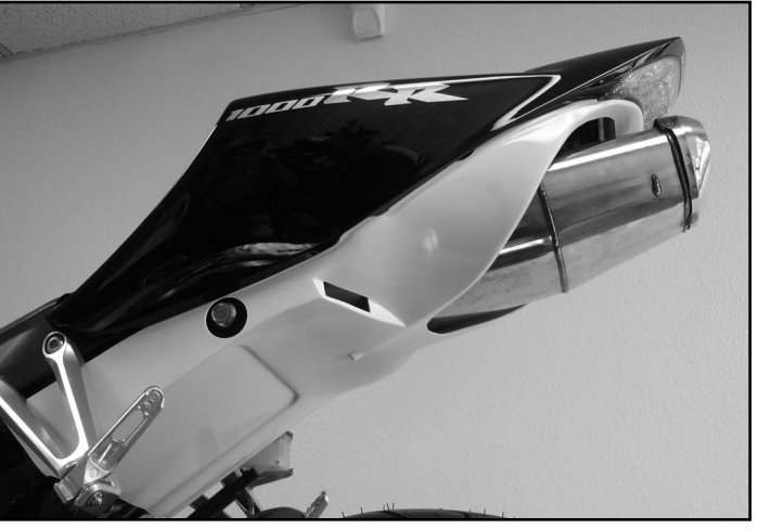
5) Make sure your exhaust is fully tightened and re-install all tail section plastics and connect the LED turn signals to the undertail. Use the plastic screw rivets to connect the undertail to the tail section.

WIRING INSTRUCTIONS: Connect the right (blue wire) and left signal (orange wire) wires on the bike, to the respective right/left <u>orange</u> wires on the undertail. The license plate light wire is black w/ brown tracer, connect to the red wire of the plate light. Connect the ground wires (green) to the <u>black</u> wires on the undertail.