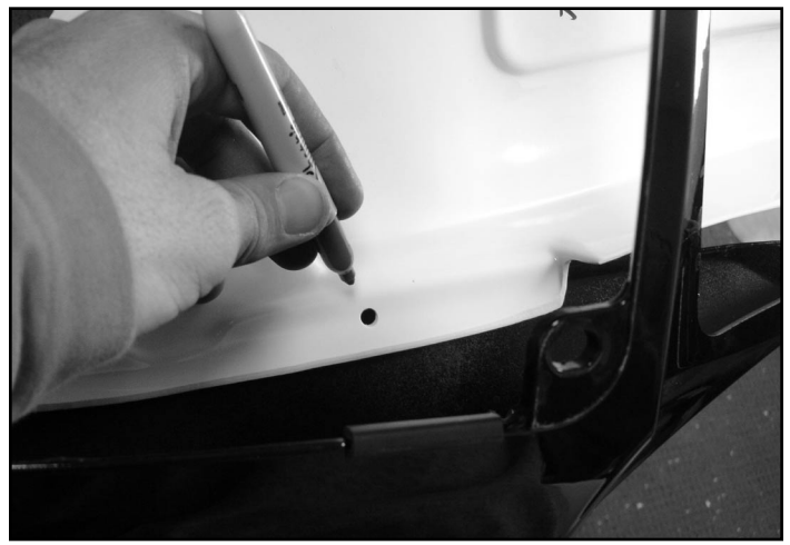
2) When tail section body work is removed, line up the undertail with tail section carefully marking two (2) holes respectively on each side. Make sure tail is correctly lined up with tail section.

1) Carefully remove the tail section body work from the bike. Disconnect the brake light wires, license plate and turn signals, then remove the stock mud flap. The stock aluminum heat shield under the tail section also needs to be removed, to remove stock heat shielding loosen or remove exhaust m mounting brackets and slide the heat shield out of place. Save all bolts, washers and plastic rivets for re-installation of tail.