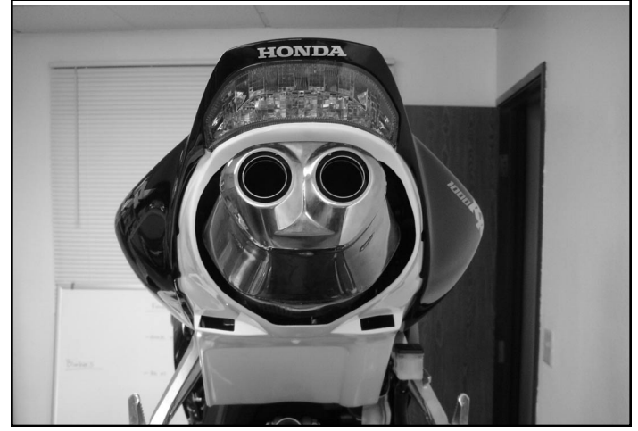
3) After drilling holes, test fit undertail on tail section, checking for proper alignment.