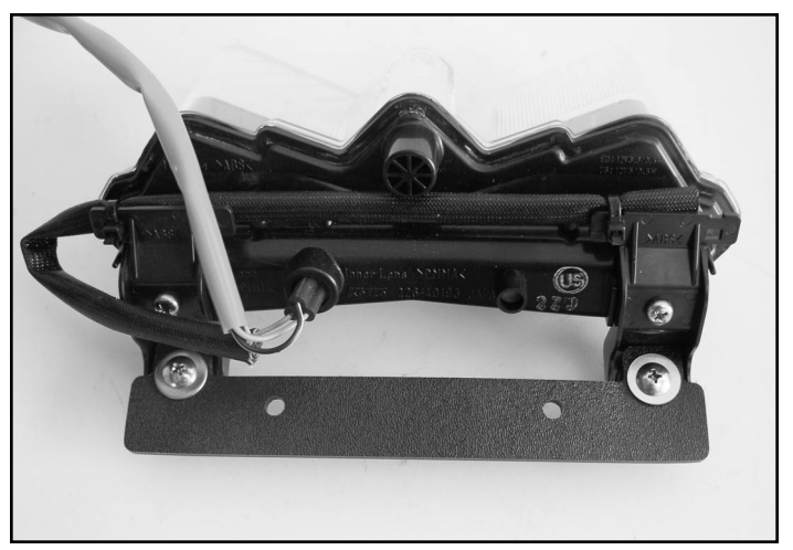
2) After removing the stock brake light, attach flat plastic bracket on the inside edge supplied with kit as shown using hardware provided.

1) Carefully remove the tail section and mud flap. Save all bolts, washers and plastic rivets for re-installation of tail. Disconnect the brake light, license plate and turn signals.