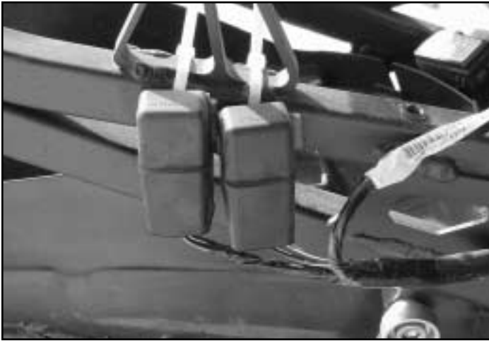
4) relocate relays to outside of subframe using 2 zip ties (not provided)