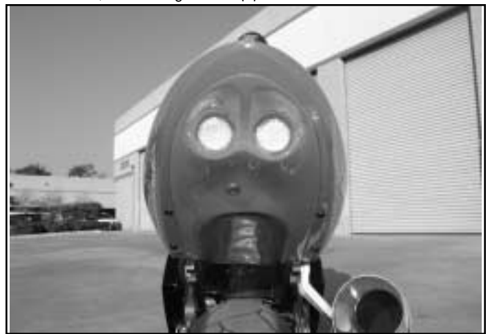
7) Inset lock into undertail using stock lock mounting clip, make sure the lock is in the correct position with the lock cable arm to function properly. Insert undertail left side first, then right side, be carefull not to crack or scratch undertail. Use your stock plastic screw rivets to hold undertail in place. Attach lock cable to lock, check movement, adjust if necessary. Tighten all hardware on tail section, attach seat. Your done!