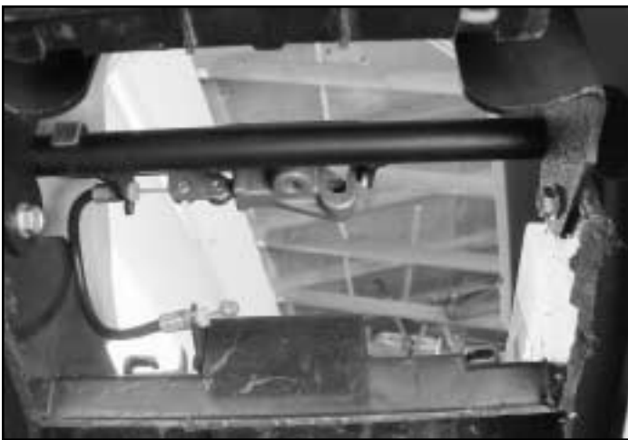
6) Re-mount glove box to bike using stock hardware. Remount tail section, leave bolts loose to allow flex in bodywork. Attach lock cable to lock clip as shown.